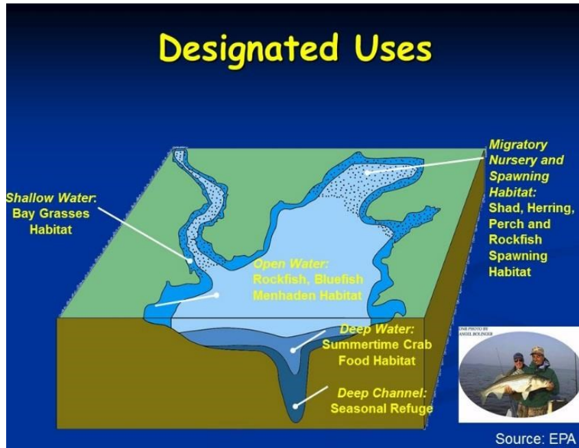
Figure 1. The 5 designated uses that apply to the Chesapeake Bay Multimetric Water Quality Standards Attainment Indicator analysis.

analyses to suggest that if we meet the 30-day mean, we also are meeting the 7-day and instantaneous criteria. Season-specific criteria can also apply.