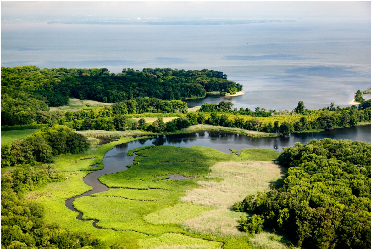
Wetlands flow into the Chesapeake Bay near the mouth of the Elk River in Cecil County, Md., on June 27, 2016.